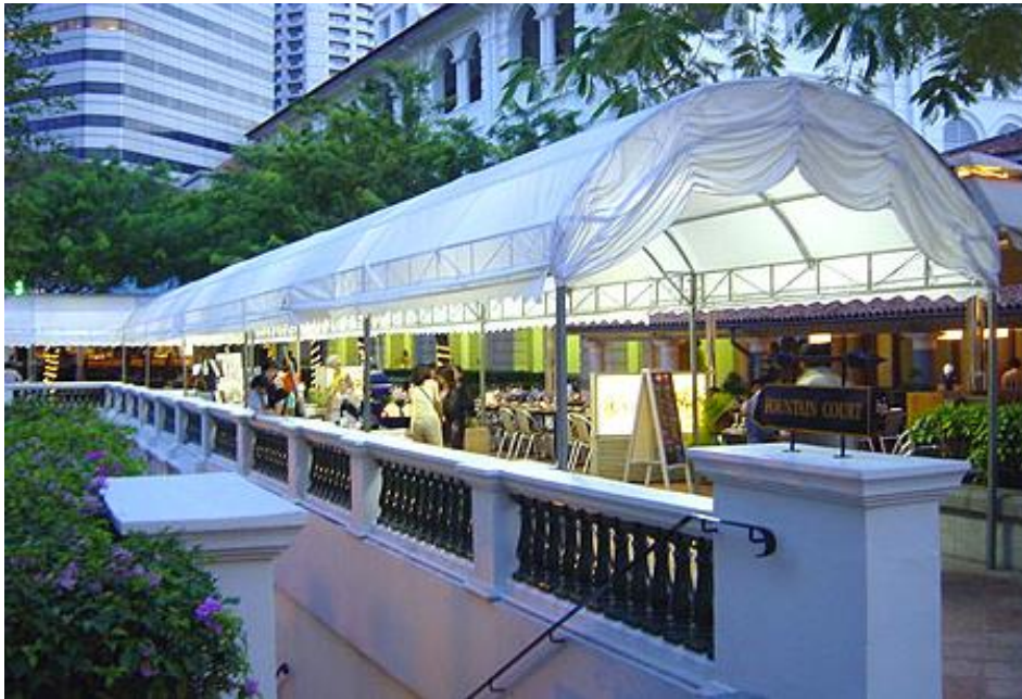
Type 1: Open-sided tentage