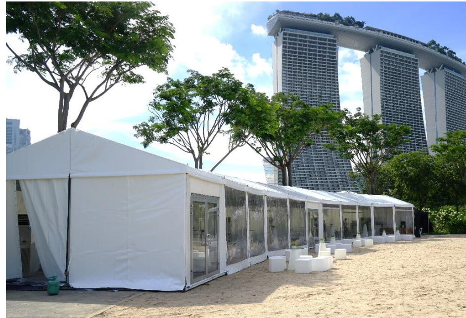
Type 2: Enclosed tentage (for aircon)